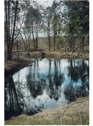
Black Earth Creek