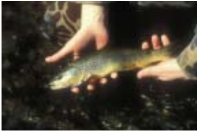
Brown Trout.

(Continued from page 5) improvements at the South Valley Road index site and the station