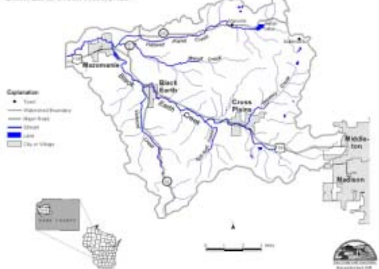
Black Earth Creek Watershed

May, 2003: Trout Days—Passport to your watershed. 11:00AM to 3:00 PM, across from the Mobil Station on Hwy. 14 in downtown Cross Plains.