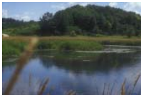
Black Earth Creek flowing through the Town of Black Earth.

main reason for the low oxygen. Various types of organic material can use up oxygen, but probably the main mechanism is reaction with ammonia.