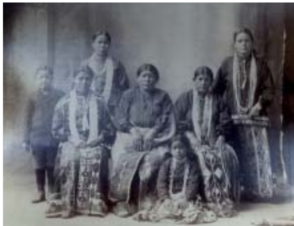
Winnebago Indians.

The rich soils along Black Earth Creek and its tributaries, the excellent fishing and abundant